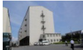
LUX Funabashi II