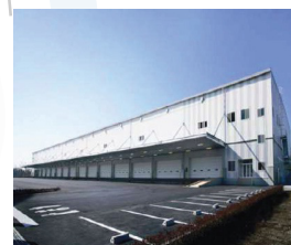
Name: Goodman Iruma Location : Saitama Acquisition Price: JPY 3.9 billion

Contact | Akihiko Sato t | (+81) 3 5411-8336 e | sato@bearlogi.jp