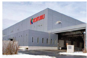
Name: Goodman Eniwa Location : Hokkaido Acquisition Price: JPY 1.5 billion

Portfolio contents: 7 logistics facilities Location: Nationwide (Greater Tokyo: 4, Greater Osaka: 1, Nagoya: 1, Hokkaido: 1) Contract date: March 2012 Buyer: Mapletree Logistics Trust Seller: Goodman Japan Acquisition price: JPY 17.5 billion GFA: 124,336 m2 Weighted Average Lease Expiry: 11.0 years Occupancy rate: 100% Major tenants: Food and consumer product industries