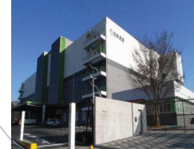
Name: Goodman Moriya Location : Ibaraki Acquisition Price: JPY 4.6 billion