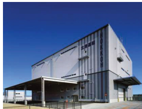
Name: Goodman Aichi Miyoshi Location : Aichi Acquisition Price: JPY 1.2 billion