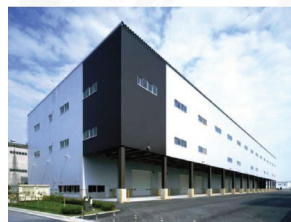
Name: Goodman Mizuomachi Location : Tokyo Acquisition Price: JPY 3.5 billion